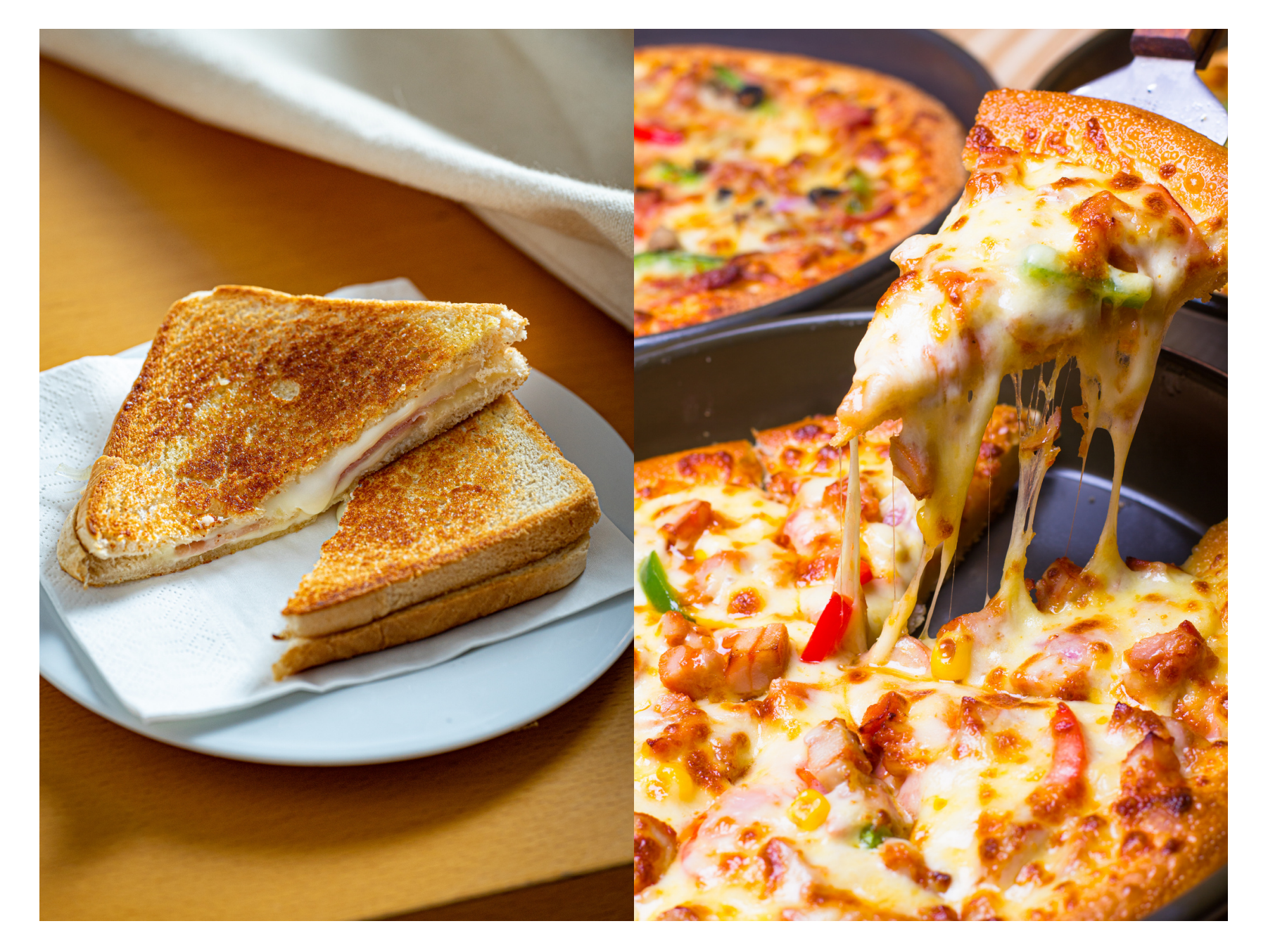
FINISHED CHEESE IS USED TO MADE FOODS LIKE GRILLED CHEESE AND PIZZA